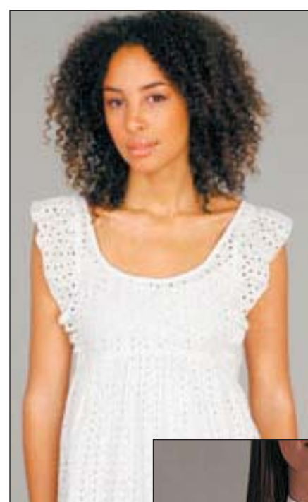
■ Elegant: Classical and yet 'cool.'