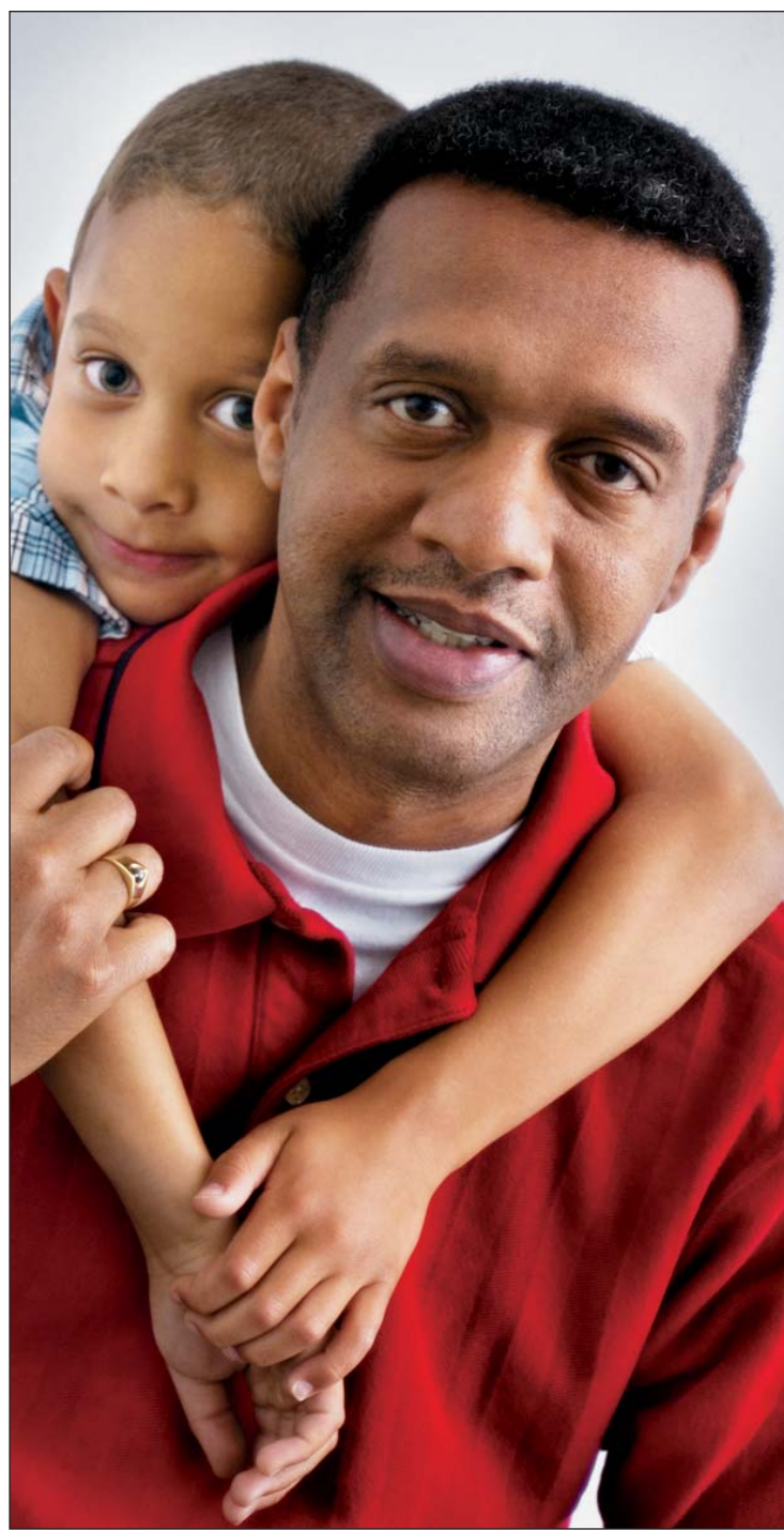
■ Wise: Knowing who to trust.

Style Matters: Amen. While these are wonderful Father's Day wishes, they ain't supporting the local retail economy. I guess it's up to us, ladies, to get out there and shop. We wish these dads and all dads a Happy Father's Day.